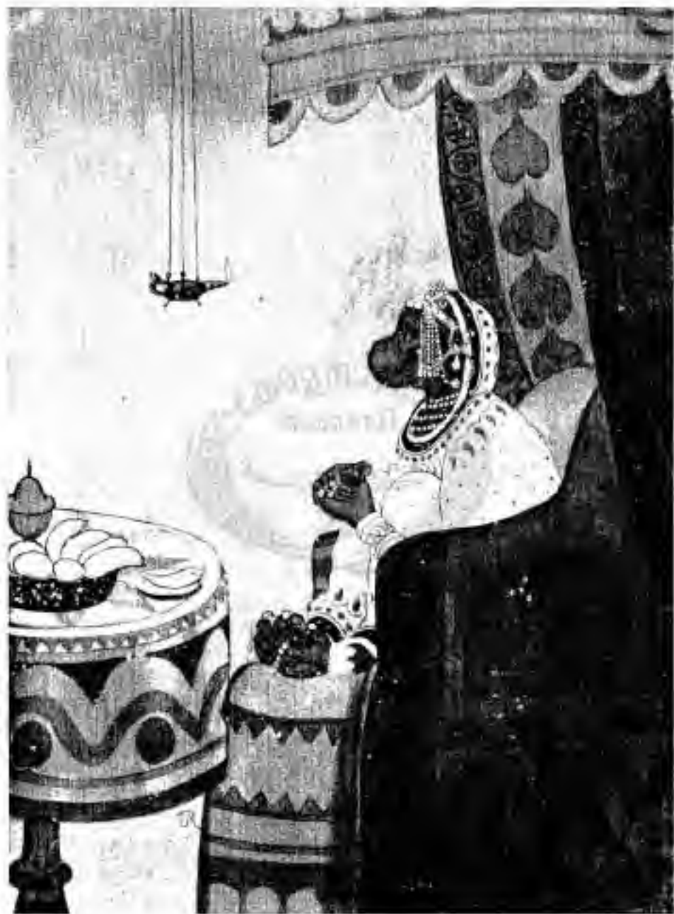
The Shahjadi monkey.